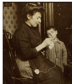
Italian family... http://www.loc.gov/pictures/item/ncl2004003316/PP/

from rural and less developed areas and performed unskilled labor. Like other immigrant groups, Italians faced harsh conditions in these unskilled jobs. Italians who tried to fight these conditions by joining unions found that many established unions would not accept foreign-born workers. Like the Irish before them, Italians became scapegoats for economic difficulties as jobs became fiercely contested. Pseudoscientific theories