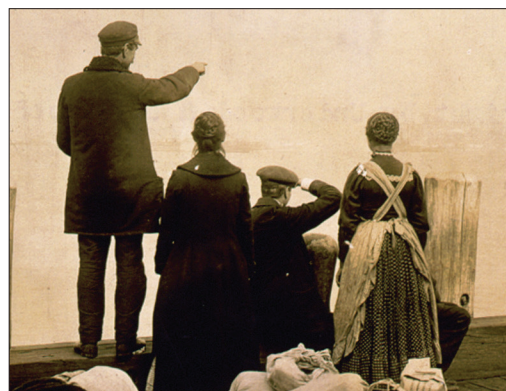
Four Immigrants and Their Belongings http://www.loc.gov/pictures/item/97501668/

From its beginnings, the United States has been shaped by people from many nations. Some of the men considered today to have been the founders of the United States were born far from the thirteen original colonies. Alexander Hamilton, for example, was born on the island of St. Kitts in the British West Indies. Nonetheless, issues surrounding immigration and citizenship have caused debate—and controversy—since the 1790s.