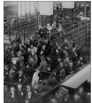
Immigrants just arrived from Foreign Countries http://www.loc.gov/pictures/item/97501095/

Between 1880 and 1920, an estimated 4 million Italian immigrants entered the United States. Many of them passed through the cramped processing center at Ellis Island just outside of New York City; Ellis Island would become a symbol of immigration during these decades. This generation of Italian immigrants hailed