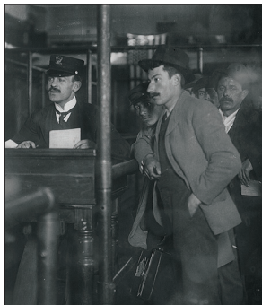
Immigrants at Ellis Island http://www.loc.gov/pictures/item/97501640/

Anti-immigrant sentiment peaked again after the end of World War I. New immigration restrictions put into place by Congress established quotas limiting most immigration by groups outside of Western Europe. The era of immigration ended for the time being. Even so, many who were already living in the United States built lasting communities and contributed to their new country.