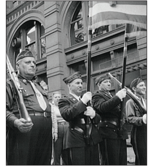
Italian-American Legionnaires

World War II were descended from recent immigrants, such as the nearly one million Italian Americans who served in the Armed Forces. In many ways, during the postwar era integration became the catchword for foreign-born Americans and their children. Despite recurring fears that immigration would stain the fabric of American society, these immigrant groups became uniquely American while also preserving their own traditions. As a new generation of immigrants enters into American life, many of the controversies and tensions evident in previous periods might again become apparent.